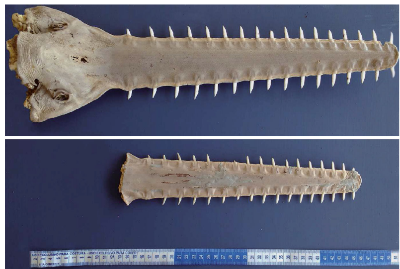
Fig. 2. Juvenile (top photo; captured 2016) and young-of-the-year (bottom photo; captured 2007) Pristis pristis rostra in Orla Viva NGO's collection of fauna specimens from the coast of Maranhão

Sawfish populations are in decline worldwide (Dulvy et al. 2016). Data regarding where these elusive creatures have sustainable populations are scarce (Fernandez-Carvalho et al. 2014). Conservation concerns in our study area arise due to the proximity of the sawfish capture points to the coast and human settlements. Human demographic growth in the region has been intense and has compromised much of the local ecosystem. Thus, sawfish stocks across the MAC are often subjected to habitat degradation as a result of mangrove deforestation, pollution (Silva et al. 2011), and strong artisanal fishing pressures. Areas such as the Canal do Navio, where 3 juvenile