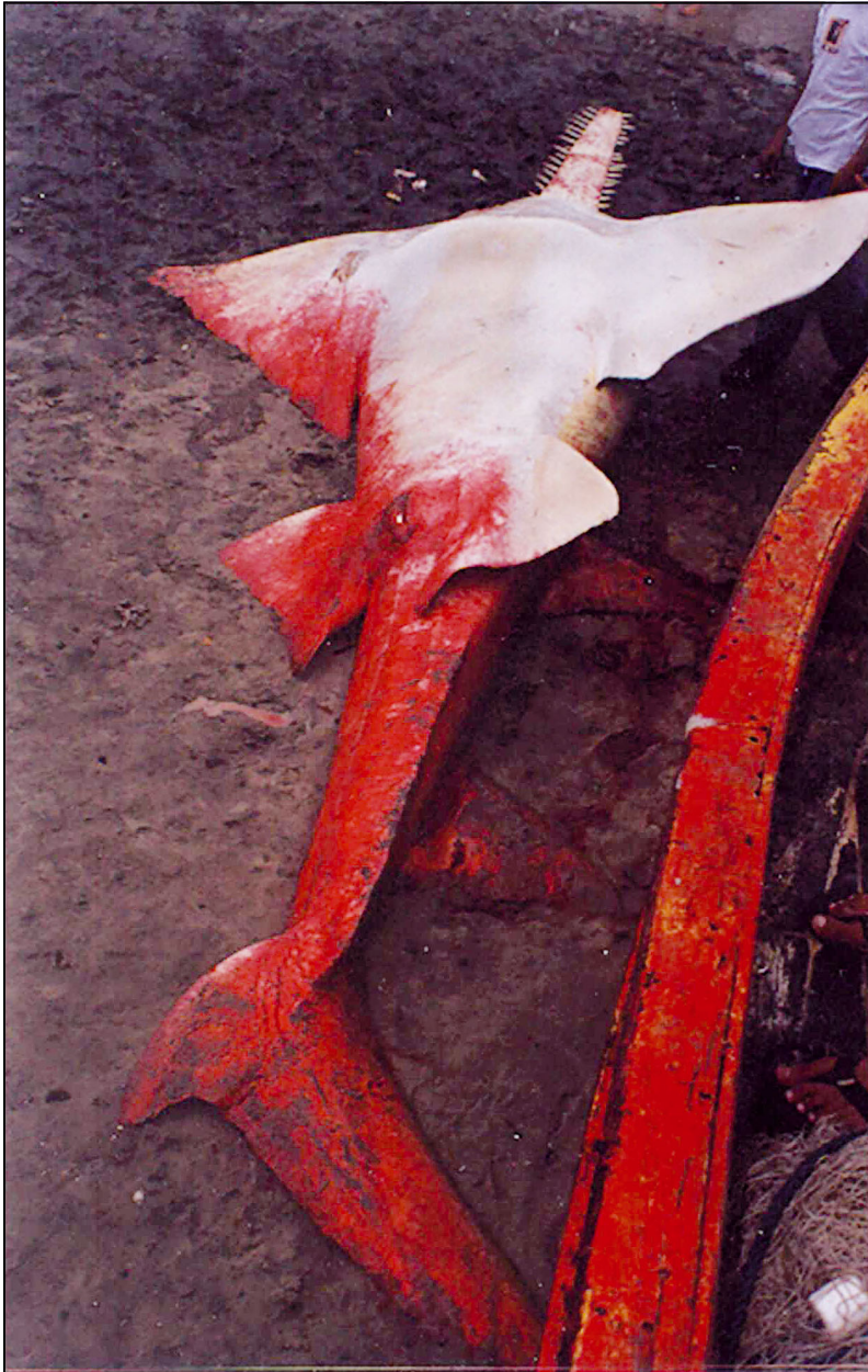
Fig. 3. Largest Pristis pristis female caught in the area to date (estimated total length: 700 cm). The individual was captured in 1998

specimens and a gravid female were caught, and Mearim River, where all catches consisted of juveniles, should be recognized as priority areas for research and conservation purposes. Despite the lack of data on sawfish biology and ecology, and the absence of continuous fishery-independent surveys in these areas, as recommended by Heupel et al. (2007), our data suggest that the Canal do Navio and the Mearim River might be potential nursery grounds for sawfish along the Amazon coast.