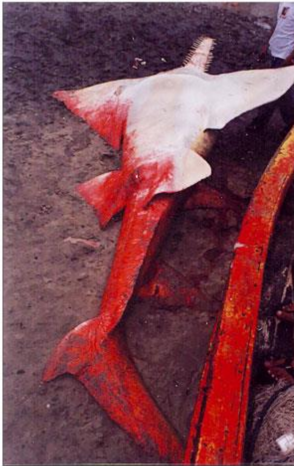
Fig. 3. Largest Pristis pristis female caught in the area to date (estimated total length: 700 cm). The individual was captured in 1998

specimens and a gravid female were caught, and Mearim River, where all catches consisted of juveniles, should be recognized as priority areas for research and conservation purposes. Despite the lack of data on sawfish biology and ecology, and the absence of continuous fishery-independent surveys in these areas, as recommended by Heupel et al. (2007), our data suggest that the Canal do Navio and the Mearim River might be potential nursery grounds for sawfish along the Amazon coast.