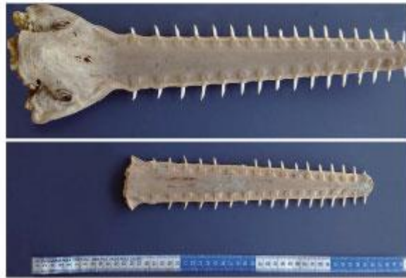
Fig. 2. Juvenile (top photo, captured 2016) and young-of-the-year (bottom photo, captured 2007) Pristis pristis rostra in Orla Viva NGO's collection of fauna specimens from the coast of Maranhão

Sawfish populations are in decline worldwide (Dulvy et al. 2016). Data regarding where these elusive creatures have sustainable populations are scarce (Fernandez-Carvalho et al. 2014). Conservation concerns in our study area arise due to the proximity of the sawfish capture points to the coast and human settlements. Human demographic growth in the region has been intense and has compromised much of the local ecosystem. Thus, sawfish stocks across the MAC are often subjected to habitat degradation as a result of mangrove deforestation, pollution (Silva et al. 2011), and strong artisanal fishing pressures. Areas such as the Canal do Navio, where 3 juvenile