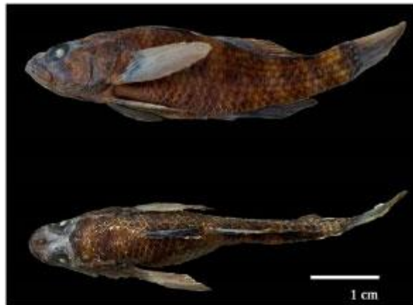
Figure 2. Lateral and dorsal view of preserved specimen of mud sleeper Batis koilomatodon found in tide pools in state of Maranhão, Brazilian Amazon coastal zone. (Photographs by Nivaldo Pioriski).

to live in environments with a wide range of water temperatures (26–36 °C) and salinity (3.8–37.0) (Miller et al. 1989; Contente et al. 2016). Previous studies showed the mud sleeper were common in the tide pools in the intertidal zone; they have limited capacity for continuous swimming, a sedentary life style, and a carnivorous diet (Contente et al. 2016). Small size and wide environmental tolerances may enable the fish to survive in ballast tanks during transoceanic voyages, and they may subsequently establish populations in new environments where introduced (Soares et al. 2012). Specimens of B. koilomatodon have been collected off of the Brazilian coastline (Macieira et al. 2012) and it is expected that it has the potential to invade coastal habitats and outcompete (for food and habitat) native fish, such as Bathygobius soporator (Valenciennes, 1837) (Contente et al. 2016).