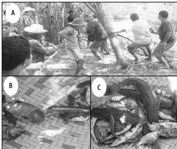
Figure 1. Moita fest: A - removal of structure; B, C - fish caught.

Based on observations and reports from members of the riverine community, about 20 species are caught in the moita . Species from 12